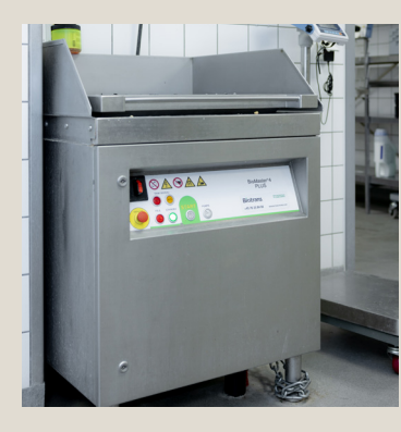
Bio trans system which sends food waste to be transformed to bio-gas