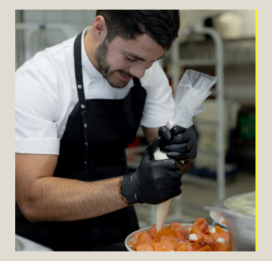
Local suppliers in all Food & Beverege outlets

Daily reporting of usage of electricity, heating, cooling, gas, waste, food waste, chemicals, towels & linen